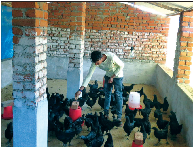
Fig.1. High value Kadaknath poultry