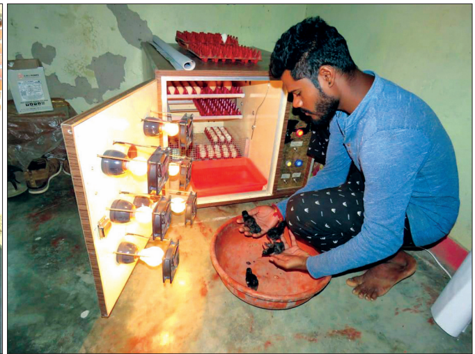
Fig. 2. Automatic egg hatchery units with the inverter and management of new chicks